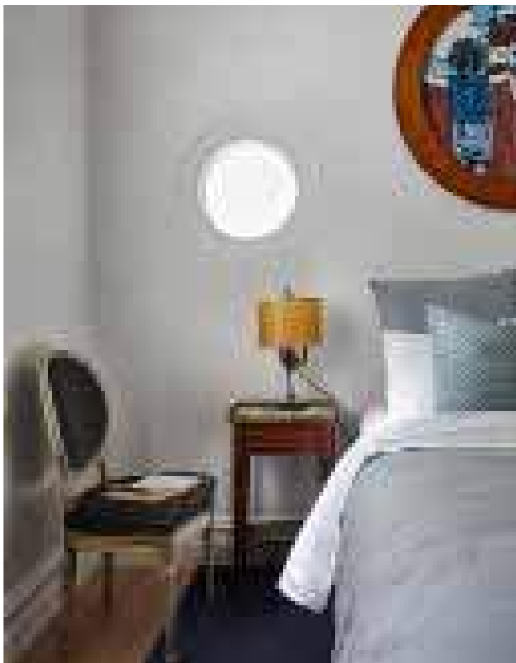
A contemporary painting by David Bromley and a Louis XVI medallion back chair continue the blue theme in the main bedroom.