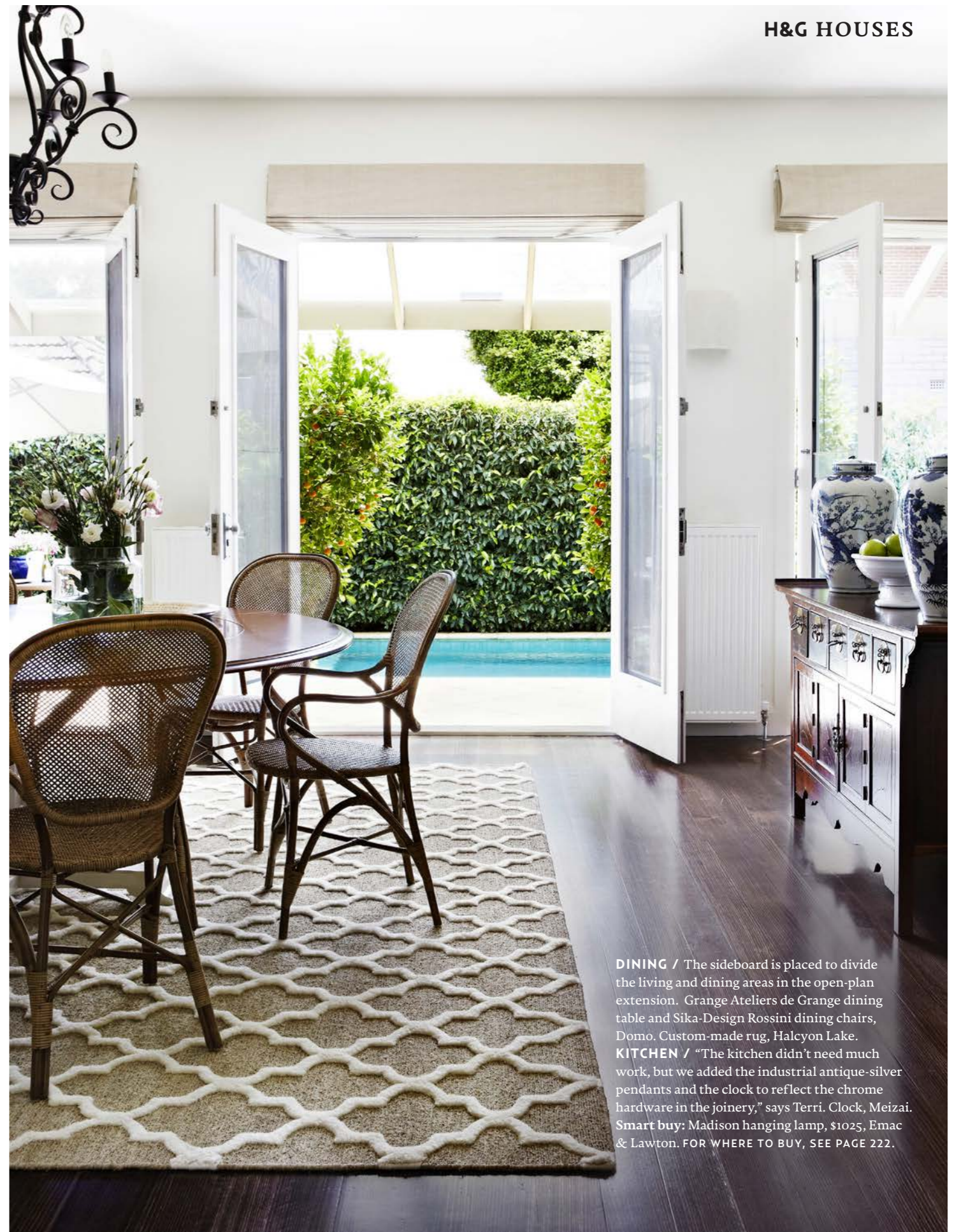
DINING / The sideboard is placed to divide the living and dining areas in the open-plan extension. Grange Ateliers de Grange dining table and Sika-Design Rossini dining chairs, Domo. Custom-made rug, Halcyon Lake. KITCHEN / "The kitchen didn't need much work, but we added the industrial antique-silver pendants and the clock to reflect the chrome hardware in the joinery," says Terri. Clock, Meizai. Smart buy: Madison hanging lamp, $1025, Emac & Lawton. FOR WHERE TO BUY, SEE PAGE 222.